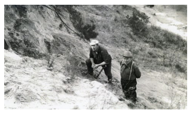
Photo 6. 5th all-Union Conference on studying the marginal formations of continental glaciation. Overview of the moraine's position within a coastal cliff with Academician G.I. Goretsky. Leliv, 1976.