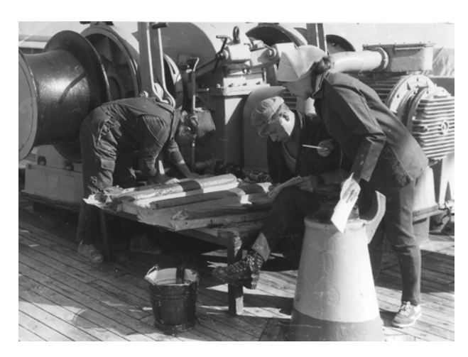
Photo 8. Description of the raised core sample column. The Black Sea expedition on the "Thaddeus Bellingshausen" hydrographic vessel; 1979.