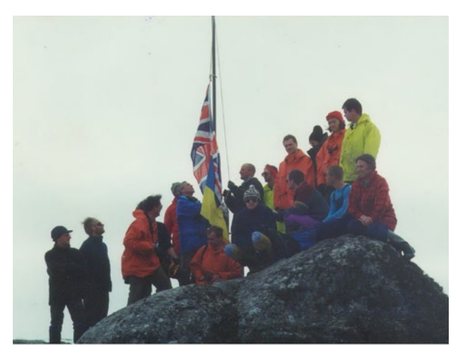
Photo 14. Ceremonial lowering the state flag of Great Britain and raising the state flag of Ukraine, which marked the inauguration of the "Academician Vernadsky" Antarctic Station. February 6, 1996.

Center of the Ministry of Education and Science of Ukraine. Academician P.F. Gozhik founded the scientific school of Ukrainian research geologists of Antarctica, and at the IGS of the NAS of Ukraine he set up a specialized subunit — the laboratory of Antarctic geoecology, which in 2004 was reorganized into the Department of Antarctic Geology and Geoecology. The department produced databases of geomorphological satellite information, compiled maps of the West Antarctic region, studied chemical geoecology, glaceochemistry, and biogeochemistry of Antarctica, and also studied chemical reactions on the surface of snow cover, the presence of halogenated hydrocarbons and heavy metals in the geological environment, performed a number of unique experiments addressing physico-chemical processes of snow and ice cover interaction with the atmosphere Gozhik, 2004; Gozhyk. et al., 2010, Arndt et al., 2013). One of the results of these studies was the publication of a unique Atlas of the Antarctic's deep structure, based on the gravimetric tomography data by Greku R. Kh., Gozhik P.F., Litvinov V. A., Usenko V. P., Greku T. R.: "Atlas of the Antarctic Deep Structure with the Gravimetric Tomography" (Greku et al., 2011).