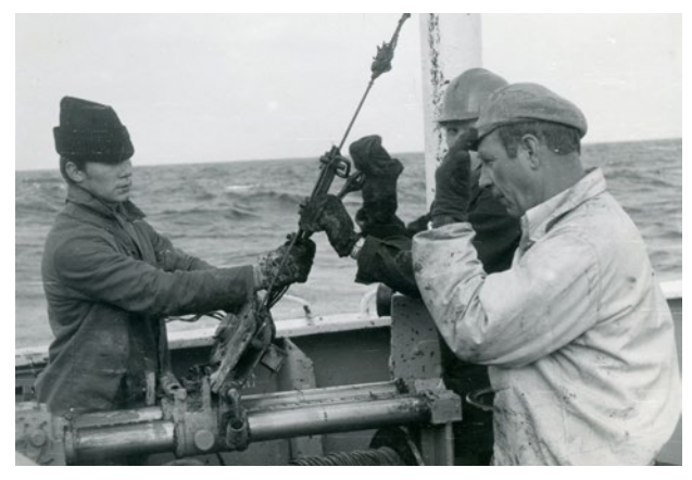
Photo 12. Preparation before the descent of the soil sampling tube in the Danube underwater canyon area; 1989.