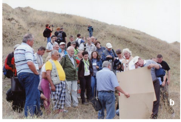
Photo 7. XVIII Ukrainian-Polish seminar "Loess cover of the northern Black Sea region". Preparation of the Roxolany key section for an international seminar (a); explaining the section's structure (b). Roxolany, 2013.