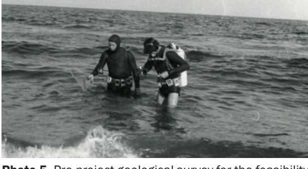
Photo 5. Pre-project geological survey for the feasibility study of the Danube-Dnieper channel route and development of the Dnieper-Bug hydroelectric power plant. After the inspection of underwater reference marks on the southern slope of the Budatsky Pass. The 1980s.